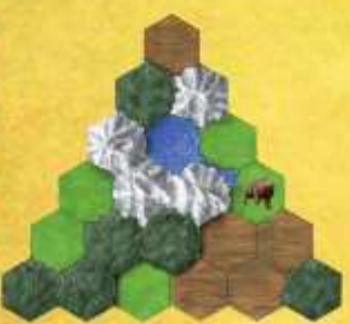
Landscape tiles: Contains 21 areas of terrain (se page 5).