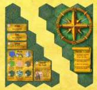
Corner tiles: The compass is frequently used to randomize directions.